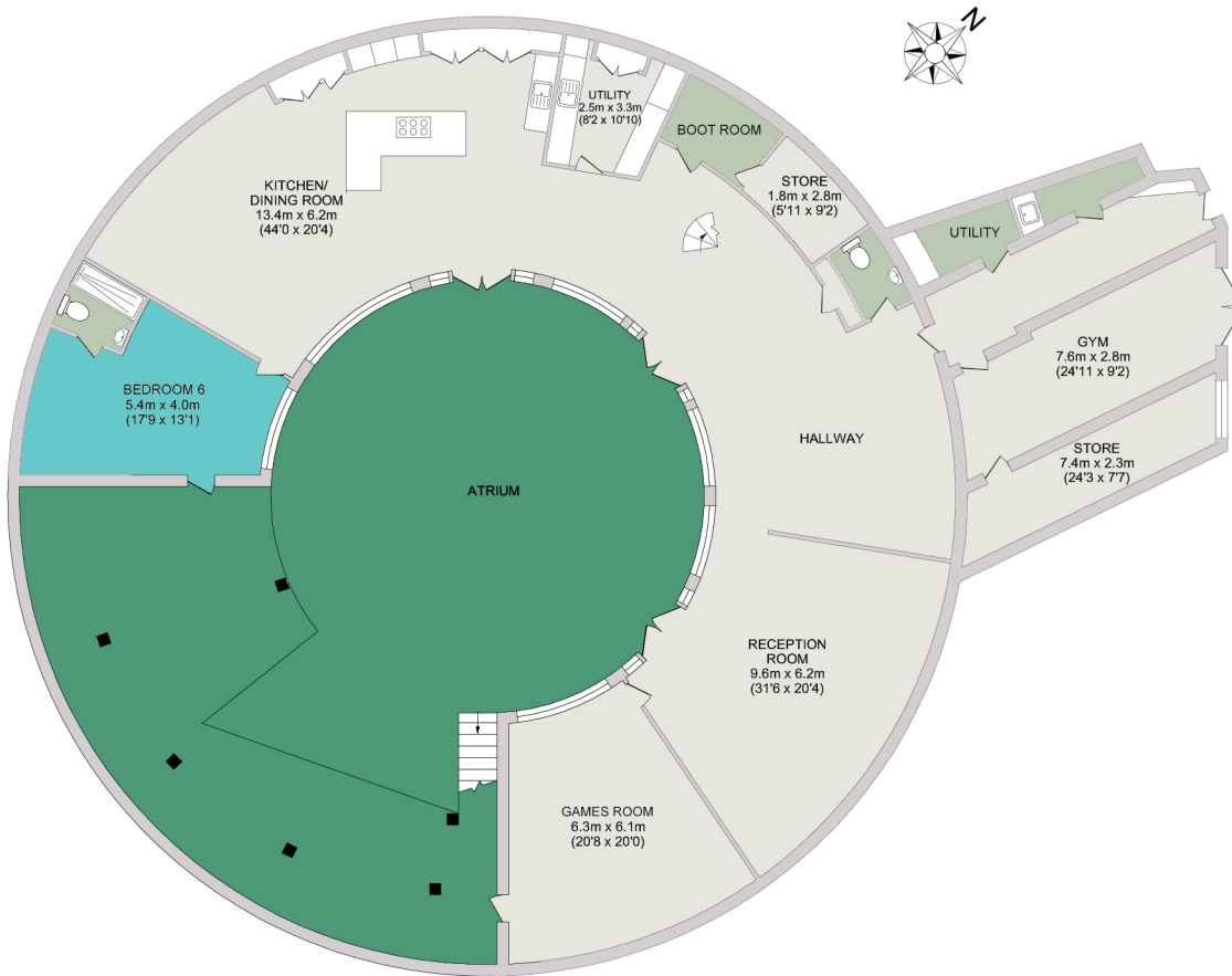
GROUND FLOOR APPROX. FLOOR AREA 518.7 SQ.M. (5584 SQ.FT.)